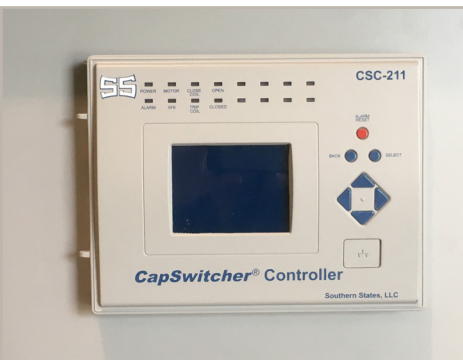
CapSwitcher Controller CSC-211 with DNP3 communication (standard on most models).