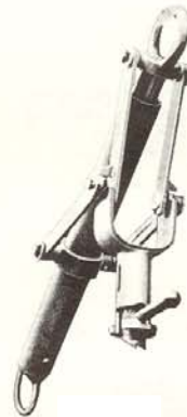
TYPE JDM-45 FOR 45° UNDERHUNG FUSES