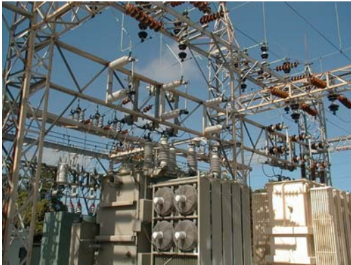
Southern States power fuses in a power transformer protection application

For your small power transformers (generally 15 MVA and below), your station service transformers, and for your capacitor banks Southern States power fuses are ideally suited to provide the reliable protection customers like you desire and insist on. With a full range of kV ratings (8.25 kV through 169 kV), continuous current ratings (1 A to 400 A), and interrupting ratings (8 kA asymmetrical to 40 kA asymmetrical), the workhorse line of Southern States expulsion power fuses (types BP, BPA, and HPA) stands ready to fill your project needs. For use in conjunction with these power fuses Southern States has a full range of kV classes and continuous current ratings of fuse kits available in 4 speeds—slow (PF speed), medium (PM speed), fast (PX speed), and NEMA-EEI standard (PE speed).